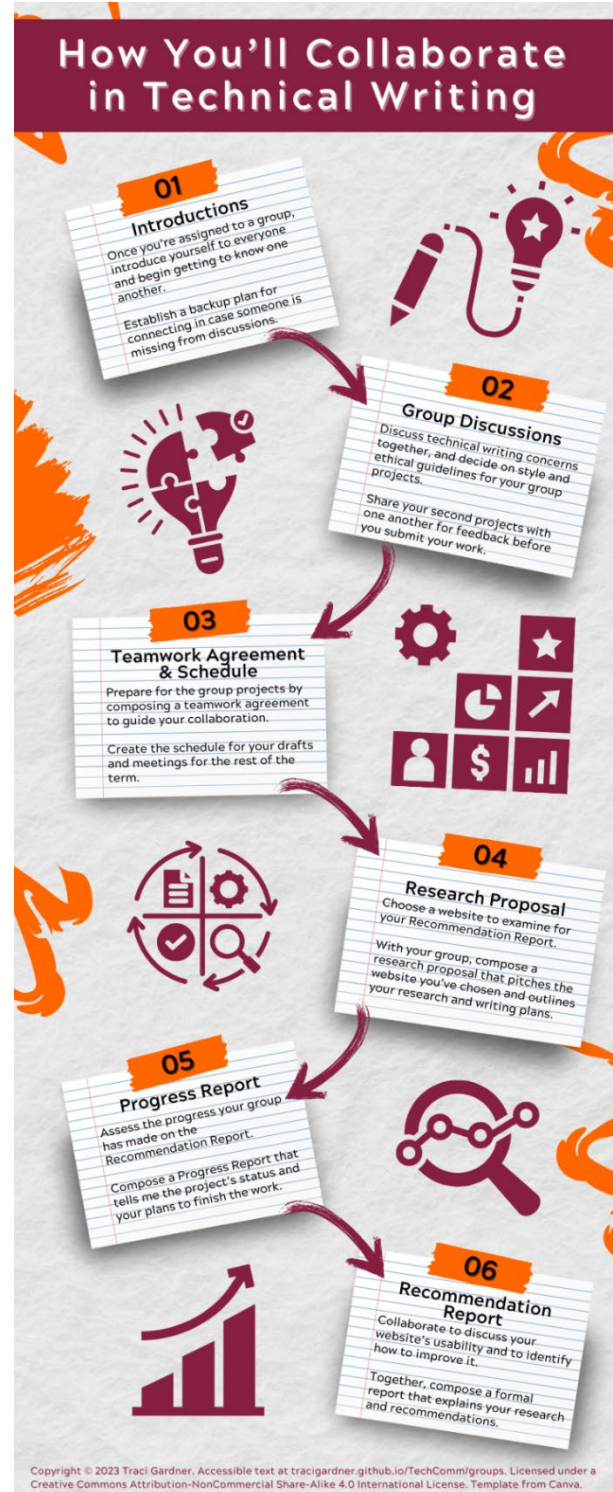
Figure 1. How You'll Collaborate in Technical Writing

Together, compose a formal report that explains your research and recommendations.